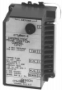
P/N 97547, G770NGC-4 Ignition Controller with Lockout

WARNING: Improper installation, adjustment, alteration, service or maintenance can cause property damage, injury, or death. Read the installation instructions thoroughly before installing this equipment.