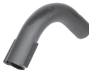
Figure 1 - 90° Heat Exchanger Elbow ("L" Tube) in Option UC2 Package -- See page 2 for illustration of reflector pieces